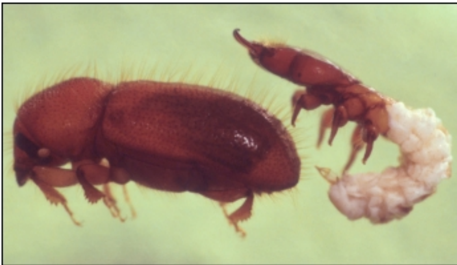
Figure 2. Ozopemon uniseriatus , adult siblings.

In 2000, BHJ, collecting in Papua New Guinea, was able to find both sexes of a further species, O. uniseriatus . DNA extracted from specimens from one gallery system provided the final proof. A series of genitalia dissections of several species also revealed an aedeagus typical for males in species closely related to Ozopemon . Indeed, Browne had been correct - though, unfortunately, he did not live to see his work vindicated. With hindsight, more careful examination of characters of Ozopemon and related genera could have been sufficient to link males and females, but as film director Billy Wilder is reported to have said: 'Hindsight is always twenty-twenty'!